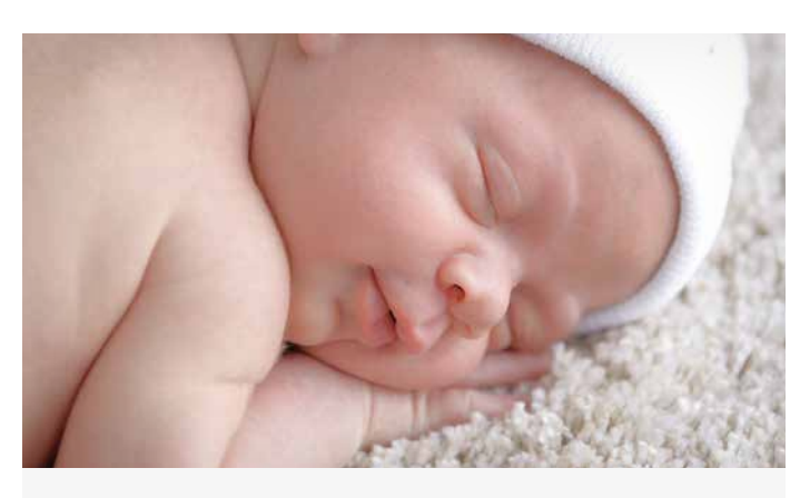
ALSO FOR YOUR YOUNGER PATIENTS