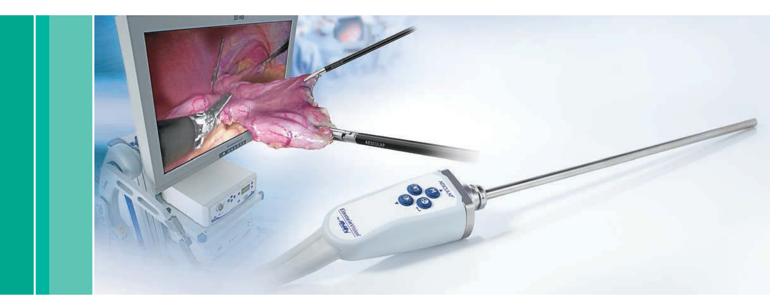
Aesculap Endoscopic Technology