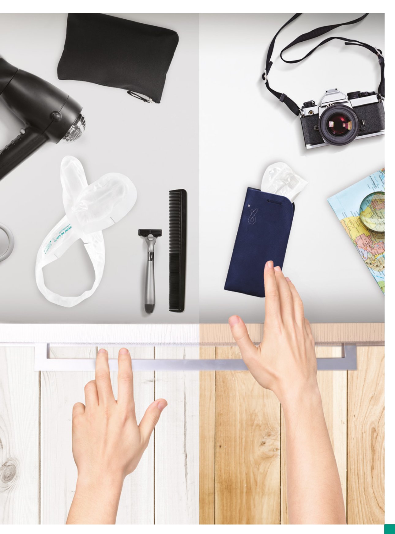
ACTREEN® HI-LITE RANGE