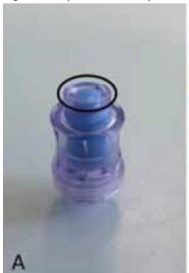
Figure 1: Experimental setup

The evaluation of the Safeflow valve demonstrated highly effective microbial tightness when applied/used according to instructions, even when exposed to excessive airborne or touch contamination.