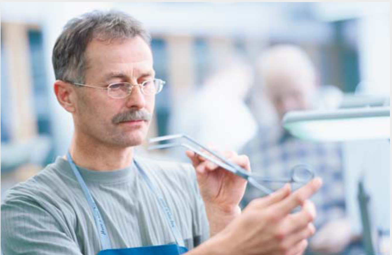
Think Quality. Think Aesculap.