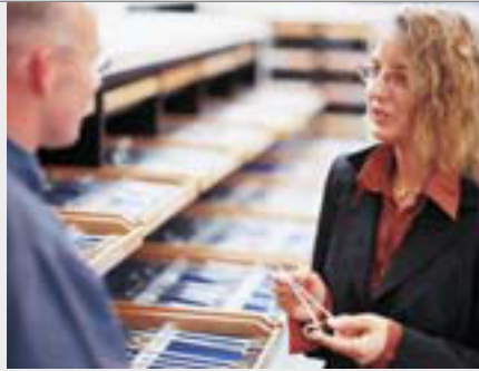
Think Competence. Think Aesculap.