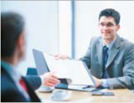
Think Partnership. Think Aesculap.