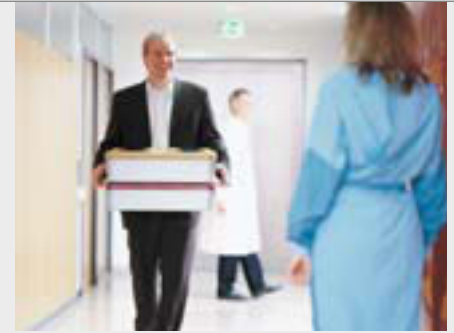
Think Service. Think Aesculap.